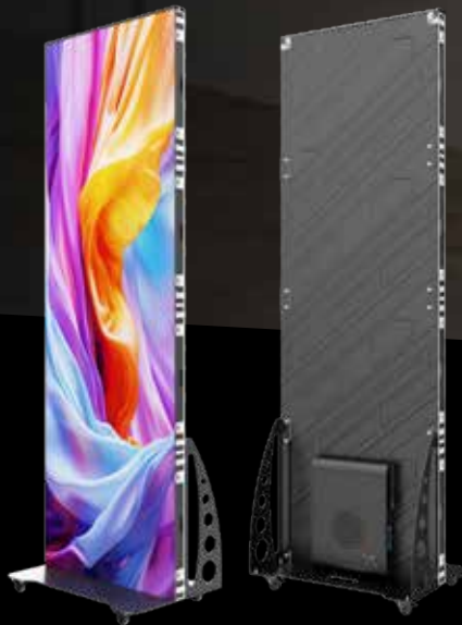
25.2" x 75.6"